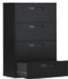
Traditional Filing Equipment 4-drawer lateral roll-out cabinets with locks Linear Filing Metres: 87